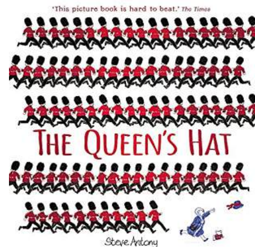
and all around...

'This picture book is hard to beat.' The Times