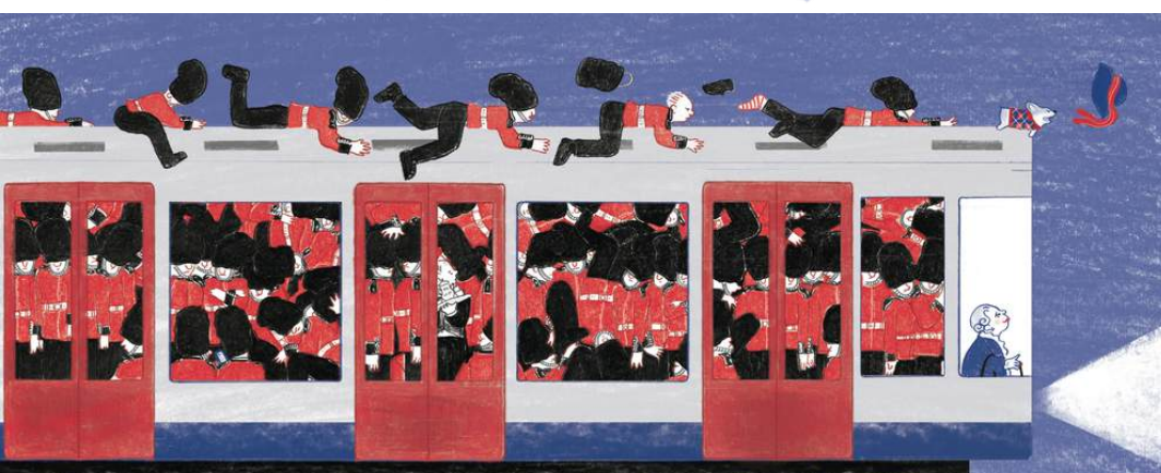
the London Underground...

It was a wonderful way to wrap up a half term full of learning and creativity, leaving everyone in high spirits as they look forward to their next adventure in the classroom.